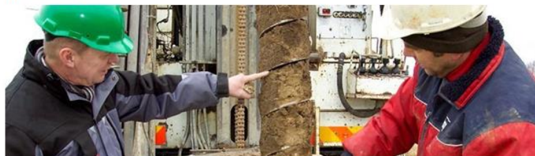
Water and soil