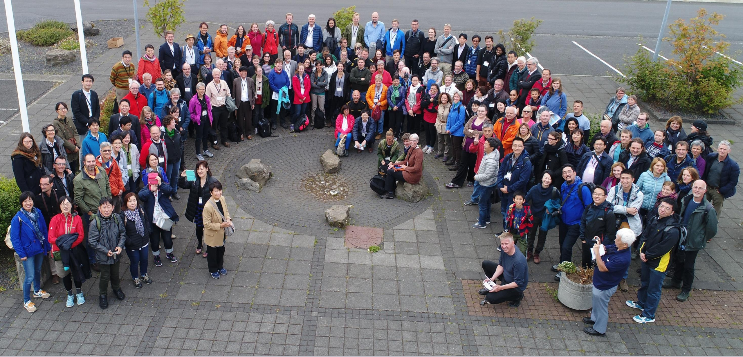
The IDReM2017 program concluded with a field trip to South-Iceland, a region challenged by a variety of natural threats. The local emergency managers hosted a meeting in the community hall and gave informative and useful presentations on emergency preparation and response in the region.