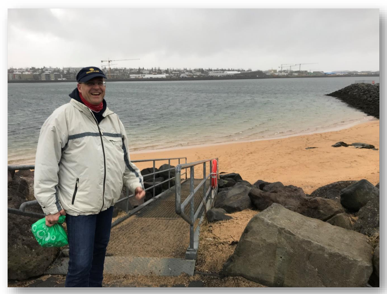
Nauthólsvík, Reykjavík, two weeks ago...