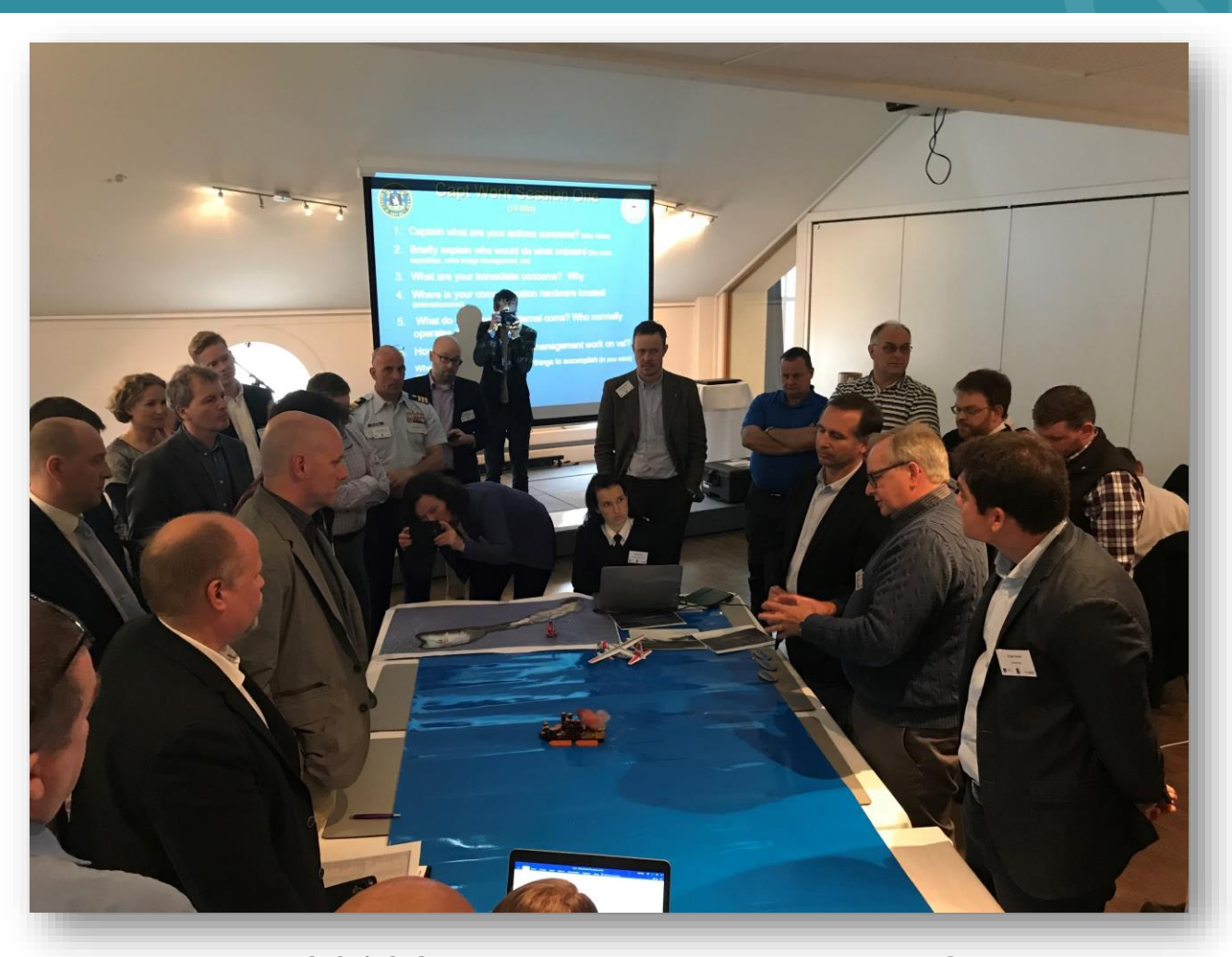
3rd Annual AECO/ICG workshop and TTX, Reykjavík, April 2018